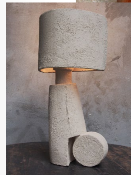
2 Paola, 2022 Lamp white Spain clay H 45 cm - L 25 cm - P 18 cm