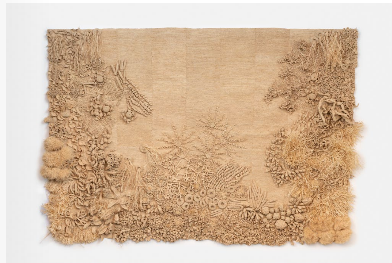
1 Paradise tapestry, 2022 Rug entirely hand-crocheted in natural raffia 260 x 160 cm

The tapestries and raffia objects are made in a family workshop in Madagascar. Natalia Brilli then works on the pieces to sheath them. All the leathers come from the dormant stocks of French and Italian luxury tanneries, which is why most of the creations are limited and numbered editions. For the furniture the designer collaborates with Belgian cabinet makers.