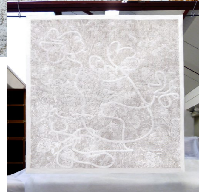
1 Magic Lace, 2022 Acoustic Sustainable Lace & Digital Creation European jute, Texel wool and PLA 120 x 120 cm Custom made panels or sheets available