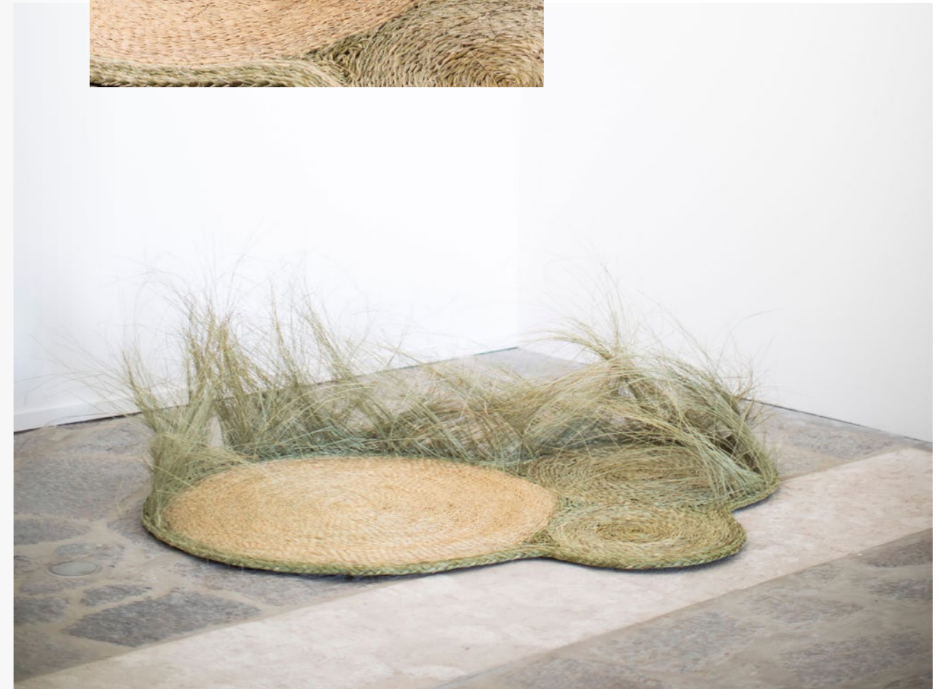
1 Clareira, 2021 Rug Stipa Gigantea, thread linen 173 x 115 x 51 cm