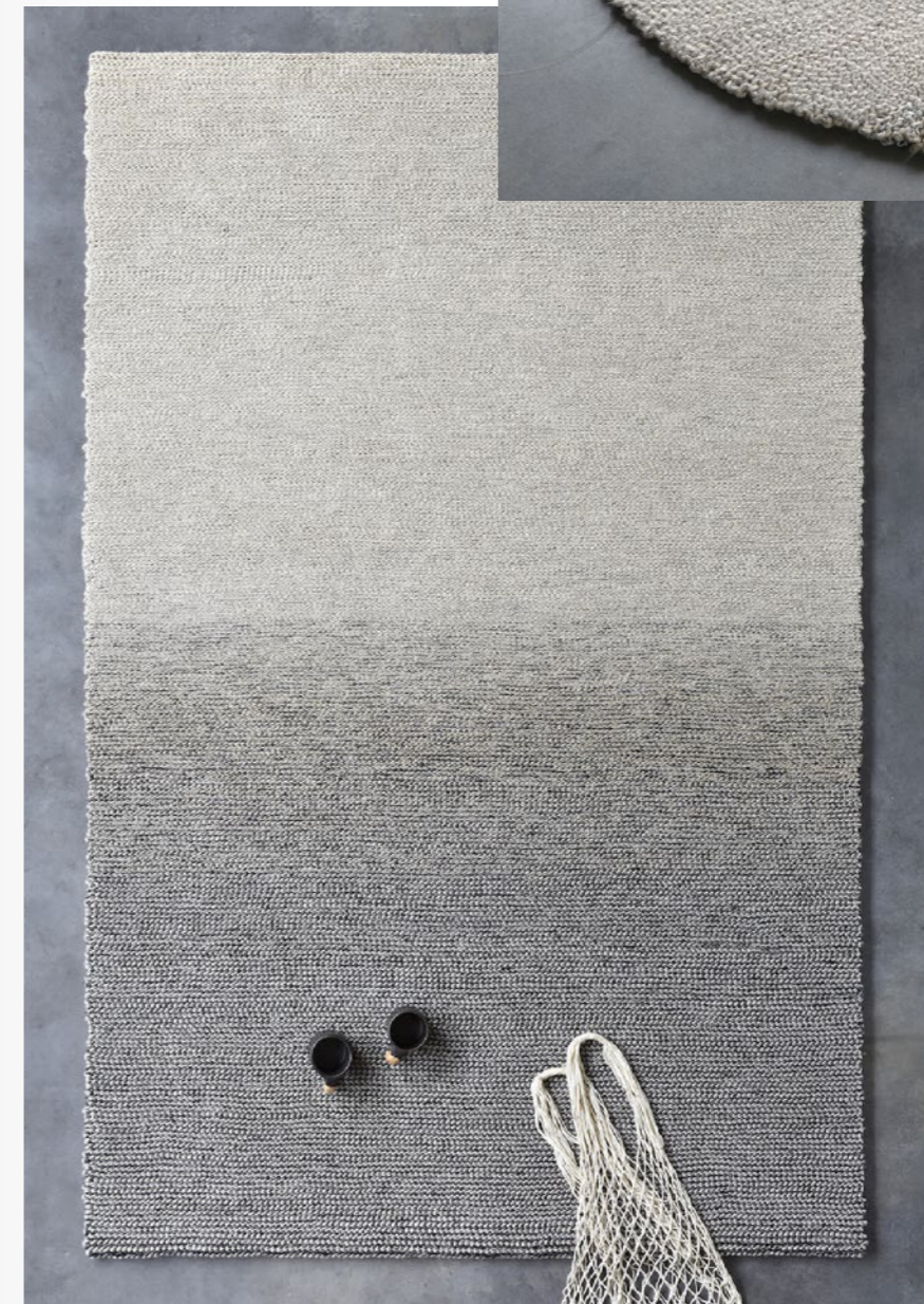
2 Shades, 2022 Rug 90% linen, 10% other fibers 120x180 cm