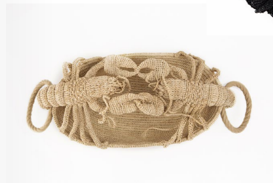
3 Lobster Basket, 2022 Limited edition 100 pcs Hand-crocheted raffia, underside of basket sheathed in tone-on-tone recycled lambskin, hemp rope handles sheathed in tone-on-tone recycled lambskin 40 x 22 x 10 cm