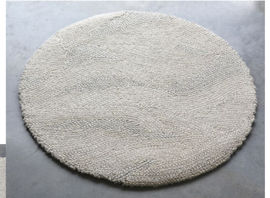
1 Slow, 2022 Rug 95% linen, 5% lurex Ø 100 cm

The vibrant pattern appearing in the SLOW series comes from the material itself in the structure of its manufacture, and evokes a movement. Here, the combination of bleached and unbleached linen with small silver accents creates an almost tone-on-tone ensemble that beautifully reveals its design in the light. Linen is a natural and ecological material. It is locally produced, requires little water to grow, and undergoes very light chemical treatments. Linen also has practical advantages: it is a good acoustic insulator, dustproof and regulates the temperature and humidity of its environment.