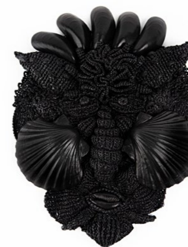
2 Fatu huku mask, 2022 Mask decorated with shells Hand-crocheted raffia Real seashells covered with recycled lambskin in a tone-on-tone colour Metal moulds covered with recycled lambskin leather in matching colours 35 x 25 cm