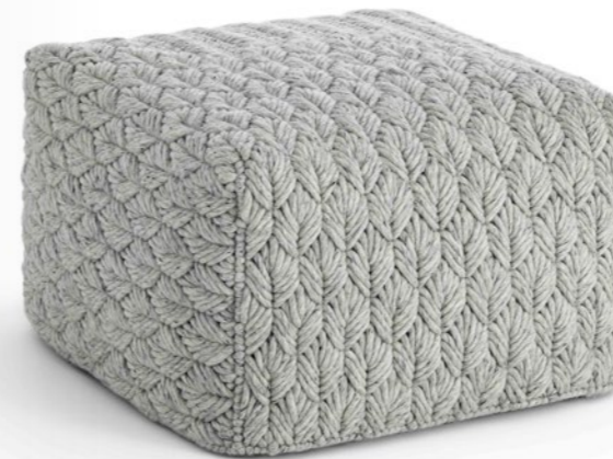
2 Chaddar Pouf, 2021 Charlotte Lancelot for GAN Ottoman Handmade 100% wool. PTFE coated fiberglass mesh. Filling: 100% foam rubber 52x52x35h / 21"x21"x14"h