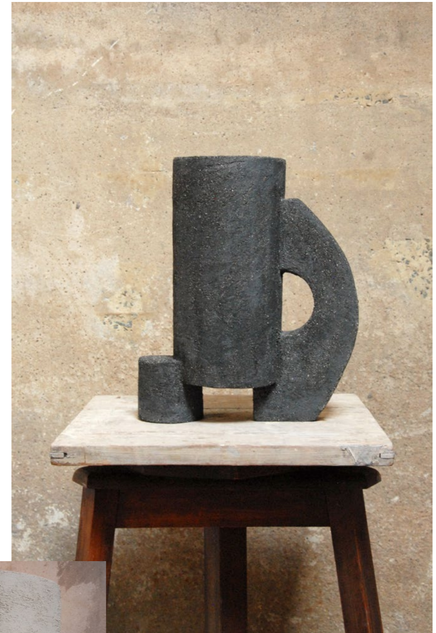
1 Antonio, 2022 Vase Spain Black Clay H 39 cm L 33 cm P 17 cm

Pascale Risbourg belongs to this generation of designers, curious and connected, who continue to develop a plural and open-ended artistic language.